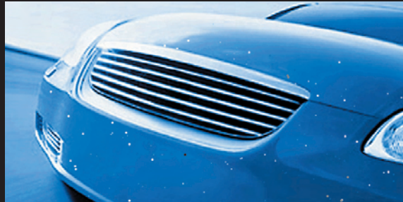
Typical damage on a leading edge painted surface without Scotchgard Paint Protection Film.