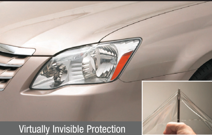
Virtually Invisible Protection

Scotchgard™ Paint Protection Film from 3M helps resist the stuff out there that harms vulnerable painted surfaces.