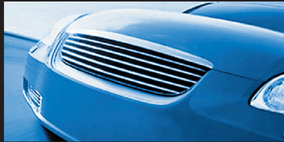
Same vehicle. Same leading surface. Notice the difference our tests confirm. Significantly reduces chips, dings and bug damage.

Additional information about Scotchgard™ Paint Protection Film is available from: